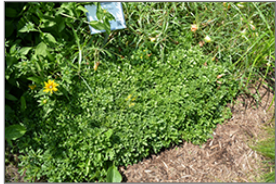
Czar's Gold Stonecrop