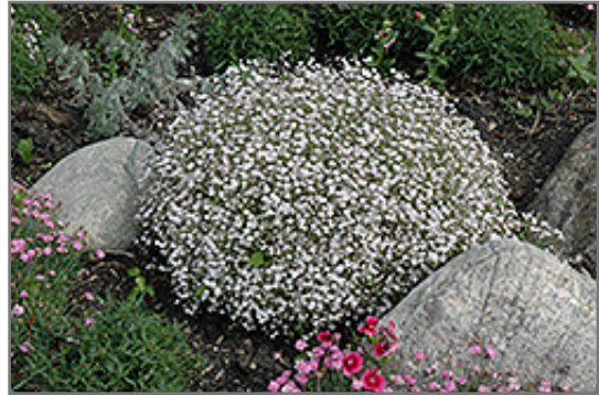
Creeping Baby's Breath in bloom