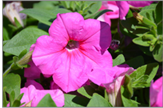
Easy Wave Pink Passion Petunia flowers

Easy Wave Pink Passion Petunia is recommended for the following landscape applications;