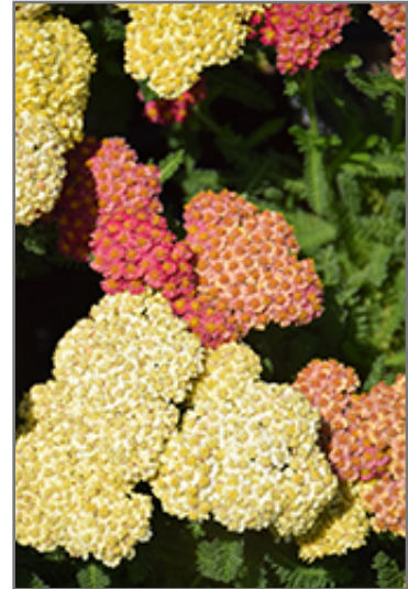
Desert Eve Terracotta Yarrow flowers

Desert Eve Terracotta Yarrow is recommended for the following landscape applications;