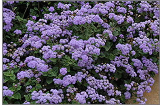
High Tide Blue Flossflower in bloom

High Tide Blue Flossflower is a fine choice for the garden, but it is also a good selection for planting in outdoor containers and hanging baskets. It is often used as a 'filler' in the 'spiller-thriller-filler' container combination, providing a mass of flowers against which the thriller plants stand out. Note that when growing plants in outdoor containers and baskets, they may require more frequent waterings than they would in the yard or garden.