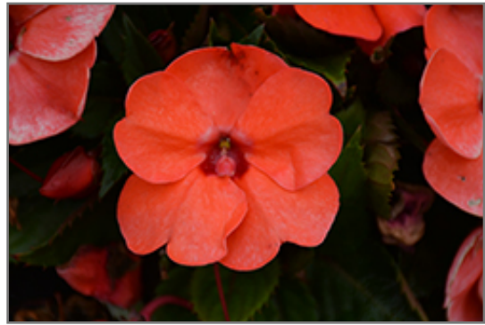
SunPatiens Compact Hot Coral New Guinea Impatiens flowers

This plant will require occasional maintenance and upkeep, and should not require much pruning, except when necessary, such as to remove dieback. It is a good choice for attracting bees and butterflies to your yard. It has no significant negative characteristics.