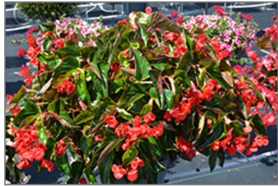
Dragon Wing Red Begonia in bloom

Dragon Wing Red Begonia is a fine choice for the garden, but it is also a good selection for planting in outdoor containers and hanging baskets. Because of its trailing habit of growth, it is ideally suited for use as a 'spiller' in the 'spiller-thriller-filler' container combination; plant it near the edges where it can spill gracefully over the pot. Note that when growing plants in outdoor containers and baskets, they may require more frequent waterings than they would in the yard or garden.