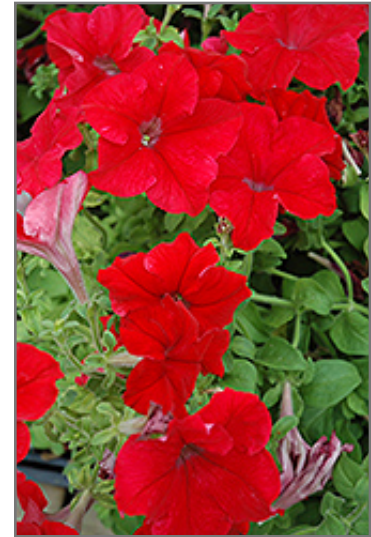
Dreams Red Petunia flowers