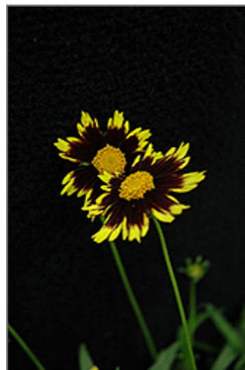
Cosmic Eye Tickseed flowers

Cosmic Eye Tickseed is recommended for the following landscape applications;