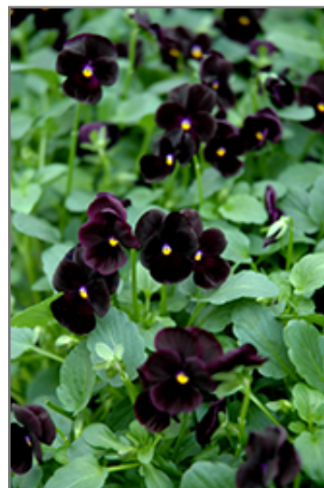
Sorbet Black Delight Pansy flowers