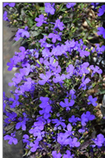
Crystal Palace Lobelia flowers

Crystal Palace Lobelia is recommended for the following landscape applications;