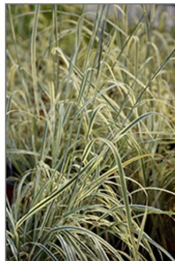
Shining Star Bluestem foliage

Shining Star Bluestem is recommended for the following landscape applications;