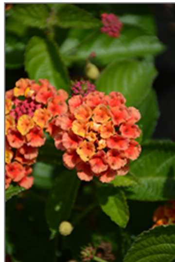
Havana Harvest Moon 2022 Lantana flowers

This is a relatively low maintenance plant, and should not require much pruning, except when necessary, such as to remove dieback. It is a good choice for attracting butterflies and hummingbirds to your yard, but is not particularly attractive to deer who tend to leave it alone in favor of tastier treats. It has no significant negative characteristics.