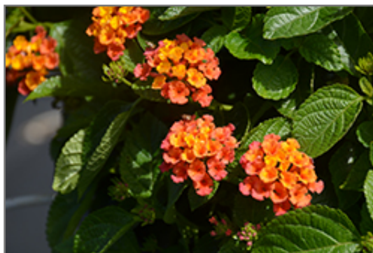
Havana Harvest Moon 2022 Lantana flowers