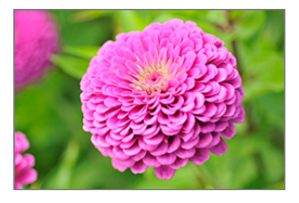
Benary's Giant Purple Zinnia flowers

2962 Jolly Lane Rapid City, SD 57703 605.393.1700 www.jollylane.com