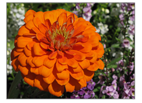
Benary's Giant Orange Zinnia flowers

2962 Jolly Lane Rapid City, SD 57703 605.393.1700 www.jollylane.com