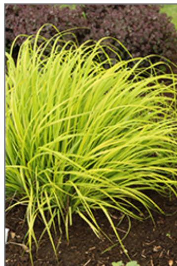
Prairie Winds Lemon Squeeze Fountain Grass

Prairie Winds Lemon Squeeze Fountain Grass is recommended for the following landscape applications;