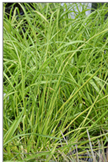
Prairie Winds Lemon Squeeze Fountain Grass foliage