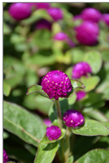
Gnome Purple Gomphrena flowers

Gnome Purple Gomphrena is recommended for the following landscape applications;