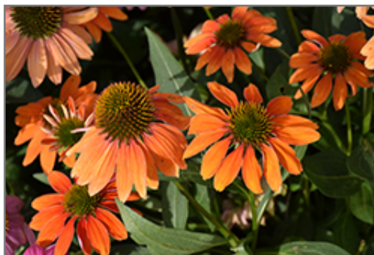
Artisan Soft Orange Coneflower flowers

Artisan Soft Orange Coneflower is recommended for the following landscape applications;