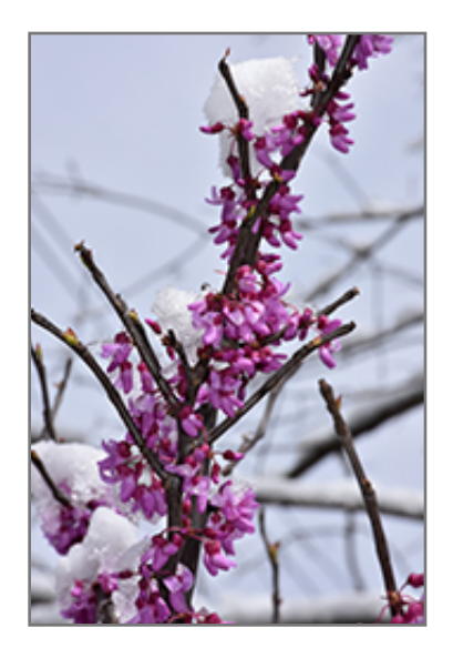
Northern Herald Redbud flowers

2962 Jolly Lane Rapid City, SD 57703 605.393.1700 www.jollylane.com