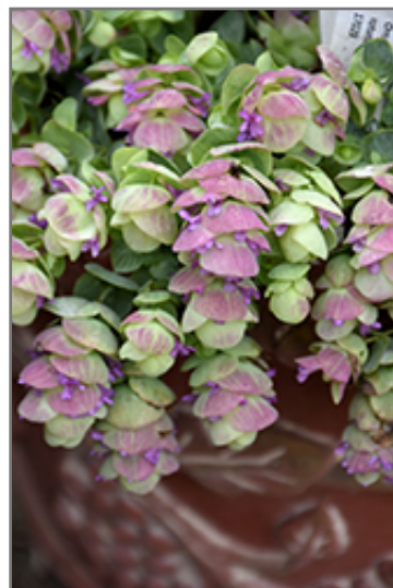
Kirigami Oregano flowers

Kirigami Oregano is recommended for the following landscape applications;