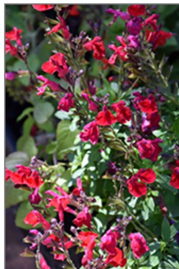
Mirage Cherry Red Autumn Sage flowers