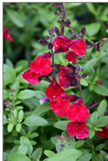
Mirage Cherry Red Autumn Sage flowers

This is a relatively low maintenance plant, and should only be pruned after flowering to avoid removing any of the current season's flowers. It is a good choice for attracting bees, butterflies and hummingbirds to your yard, but is not particularly attractive to deer who tend to leave it alone in favor of tastier treats. It has no significant negative characteristics.