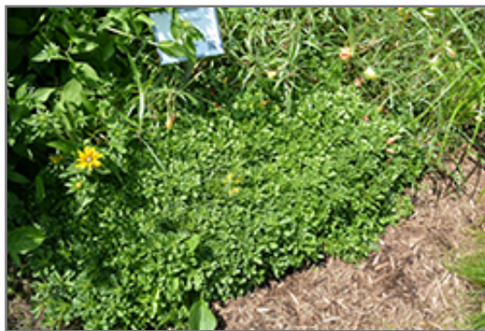
Czar's Gold Stonecrop