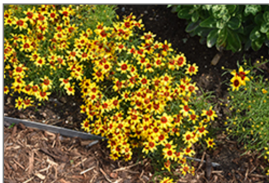
Sizzle And Spice Curry Up Tickseed in bloom