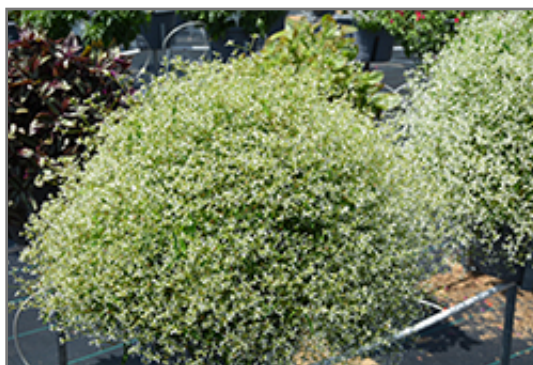
Glitz Euphorbia in bloom