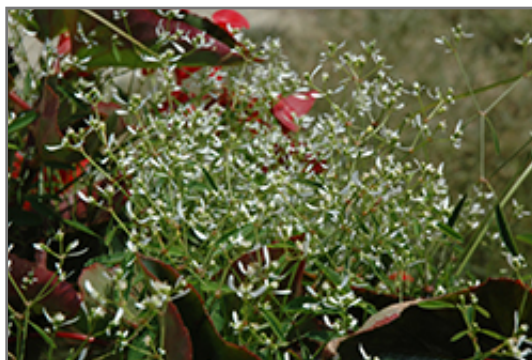
Glitz Euphorbia flowers

Glitz Euphorbia is a fine choice for the garden, but it is also a good selection for planting in outdoor containers and hanging baskets. It is often used as a 'filler' in the 'spiller-thriller-filler' container combination, providing a mass of flowers against which the thriller plants stand out. Note that when growing plants in outdoor containers and baskets, they may require more frequent waterings than they would in the yard or garden.