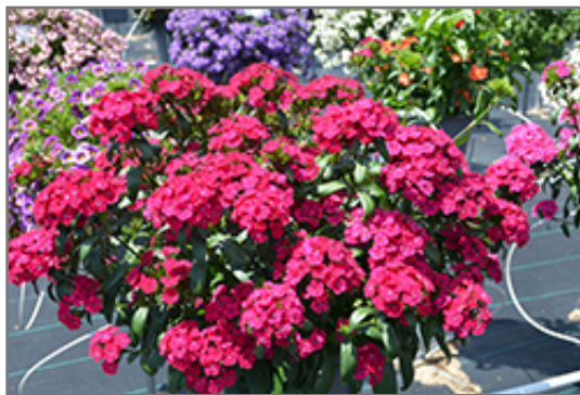
Jolt Cherry Hybrid Pinks in bloom