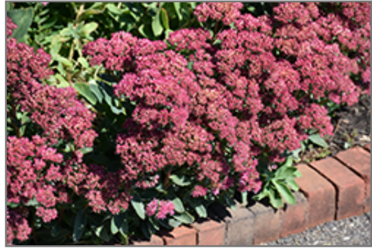
Carl Stonecrop in bloom

This is a relatively low maintenance plant, and is best cleaned up in early spring before it resumes active growth for the season. It is a good choice for attracting bees and butterflies to your yard, but is not particularly attractive to deer who tend to leave it alone in favor of tastier treats. It has no significant negative characteristics.