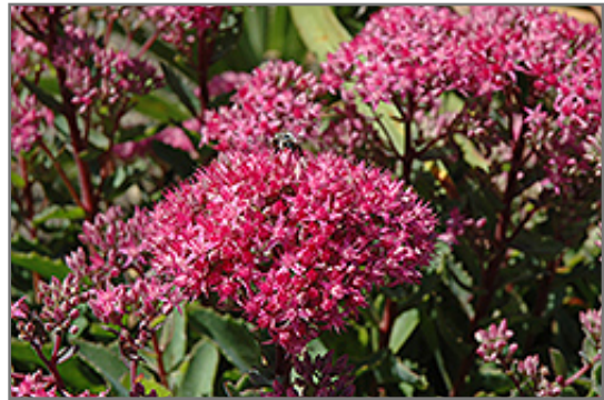
Carl Stonecrop flowers