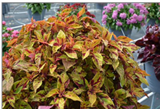
Premium Sun Mighty Mosaic Coleus