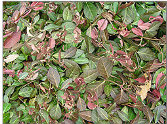
Purpleleaf Wintercreeper foliage

Purpleleaf Wintercreeper is recommended for the following landscape applications;