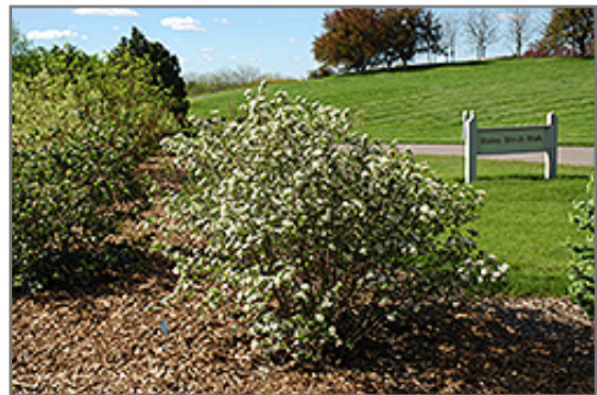
Autumn Magic Black Chokeberry in bloom