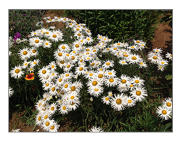
Crazy Daisy Shasta Daisy in bloom