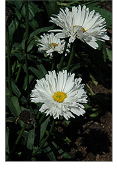
Crazy Daisy Shasta Daisy flowers