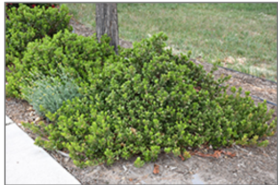
Panchito Manzanita