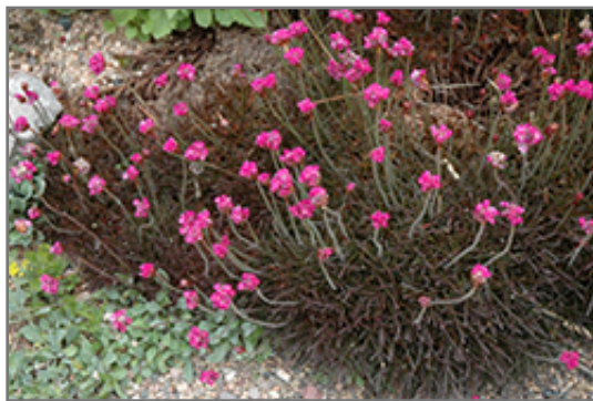
Red-leaved Sea Thrift in bloom