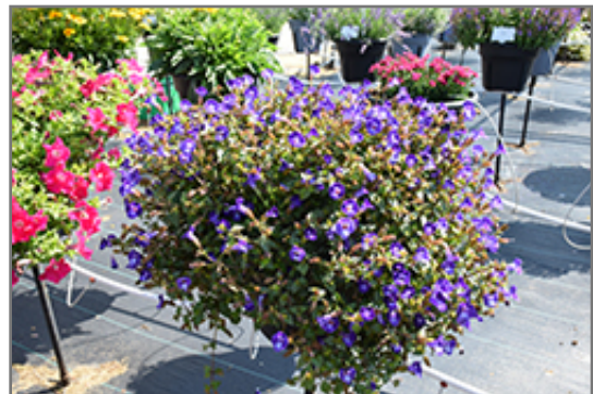
Summer Wave Bouquet Deep Blue Torenia in bloom