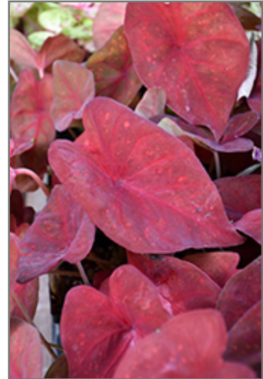
Burning Heart Caladium foliage

Burning Heart Caladium is recommended for the following landscape applications;