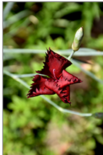
Grenadin King Of The Blacks Carnation flowers

Grenadin King Of The Blacks Carnation is recommended for the following landscape applications;