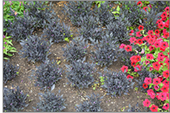
Onyx Red Ornamental Pepper

This plant will require occasional maintenance and upkeep, and should not require much pruning, except when necessary, such as to remove dieback. It is a good choice for attracting bees and butterflies to your yard, but is not particularly attractive to deer who tend to leave it alone in favor of tastier treats. It has no significant negative characteristics.