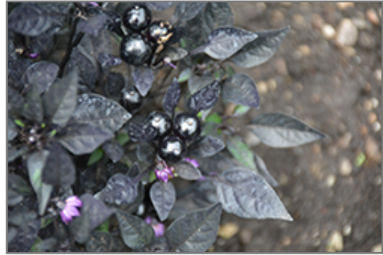
Onyx Red Ornamental Pepper fruit