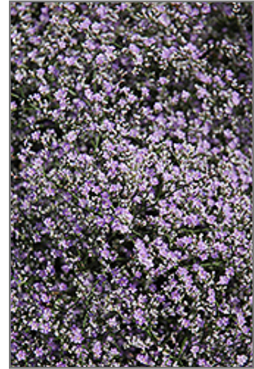
Sea Lavender flowers