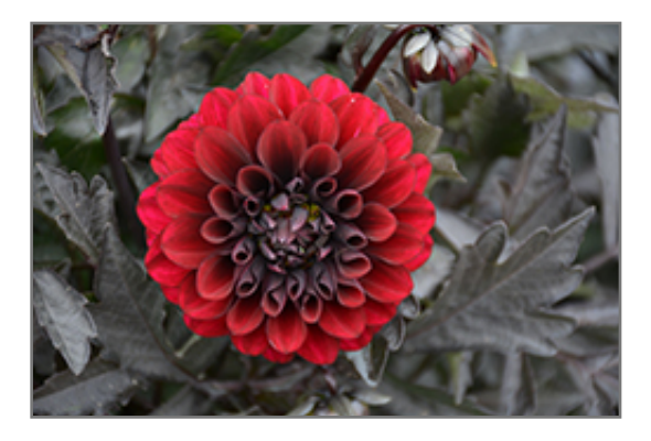
City Lights Purple Dahlia flowers

City Lights Purple Dahlia is recommended for the following landscape applications;