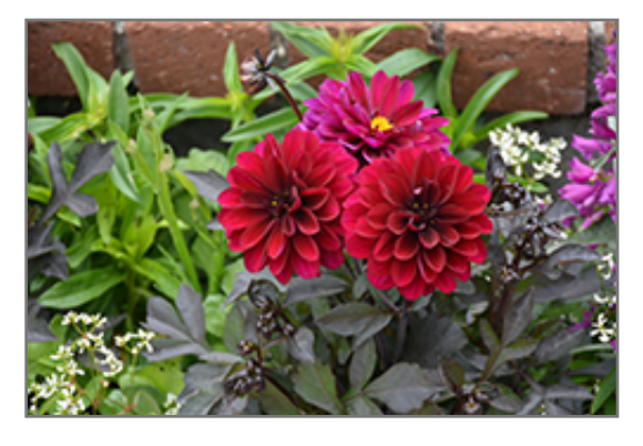
City Lights Purple Dahlia in bloom

2962 Jolly Lane Rapid City, SD 57703 605.393.1700 www.jollylane.com