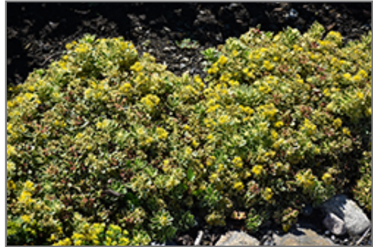
Rock 'N Low Boogie Woogie Stonecrop in bloom