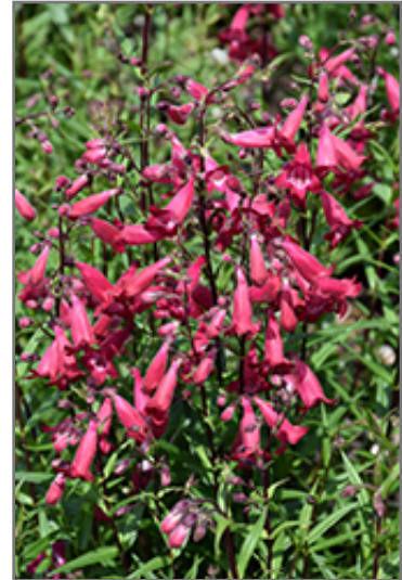
MissionBells Deep Rose Beard Tongue flowers

MissionBells Deep Rose Beard Tongue is recommended for the following landscape applications;