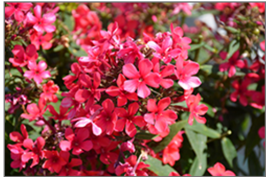
Early Red Garden Phlox flowers