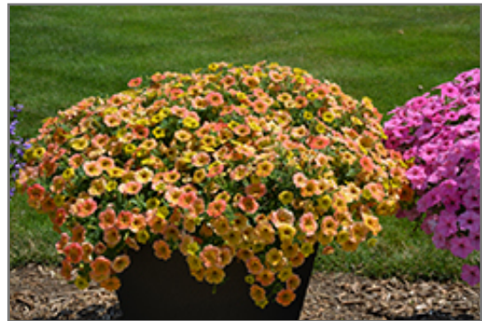
Supertunia Honey Petunia in bloom