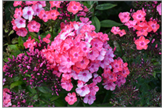
Garden Girls Glamour Girl Garden Phlox flowers

Garden Girls Glamour Girl Garden Phlox is recommended for the following landscape applications;