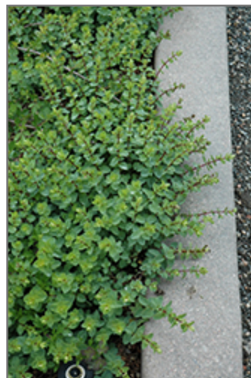
Lebanese Oregano