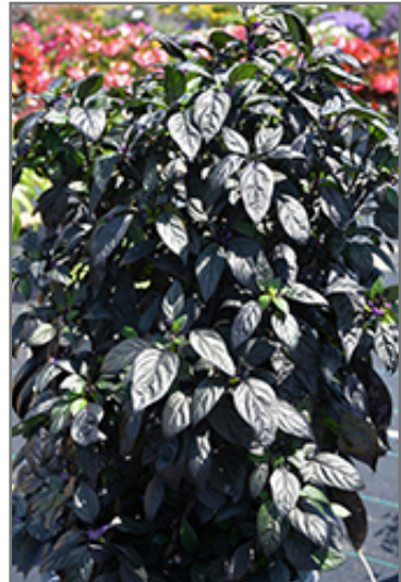
Black Pearl Ornamental Pepper