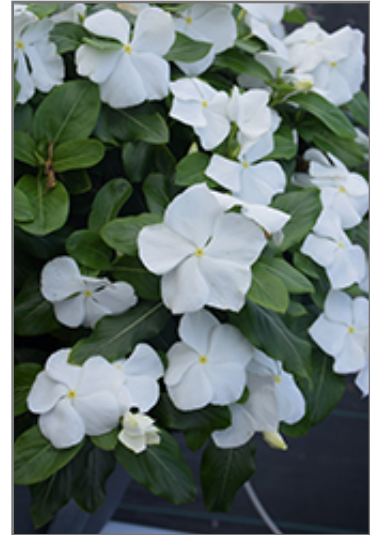
Titan Pure White Vinca flowers

Titan Pure White Vinca is recommended for the following landscape applications;