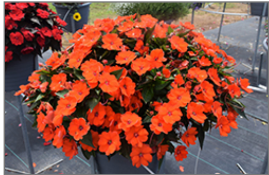
SunPatiens Compact Electric Orange New Guinea Impatiens in bloom

SunPatiens Compact Electric Orange New Guinea Impatiens is a fine choice for the garden, but it is also a good selection for planting in outdoor containers and hanging baskets. It can be used either as 'filler' or as a 'thriller' in the 'spiller-thriller-filler' container combination, depending on the height and form of the other plants used in the container planting. It is even sizeable enough that it can be grown alone in a suitable container. Note that when growing plants in outdoor containers and baskets, they may require more frequent waterings than they would in the yard or garden.