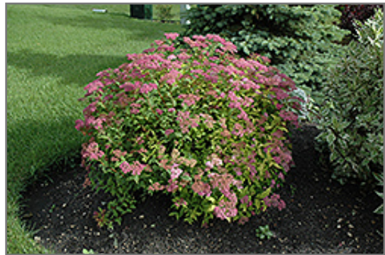
Goldflame Spirea in bloom