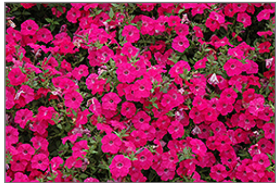
Tidal Wave Hot Pink Petunia in bloom