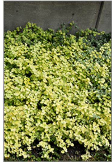
Lemon Licorice Plant